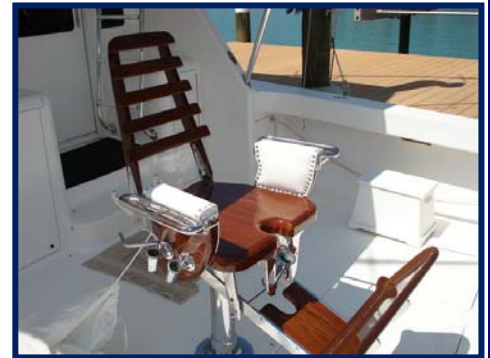
Refinished Fighting Chair