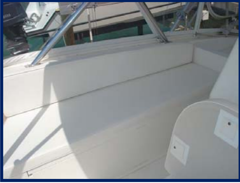
Flybridge Port Side Seating