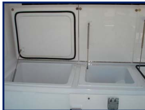
Tackle Cabinet w/ Freezer