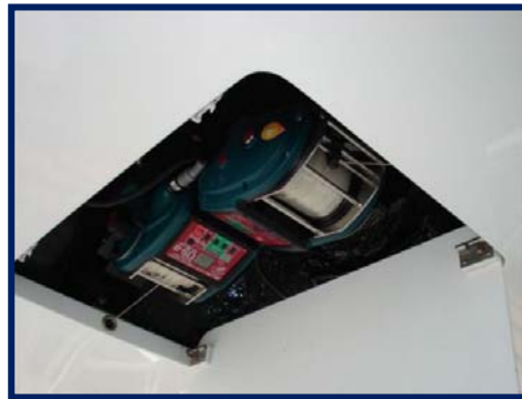
Electrical Teaser Reels