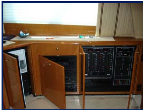
Home Theater / Icemaker