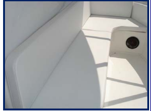
Forward Flybridge Seating