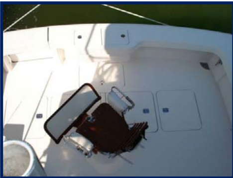
Aerial View of Fighting Chair