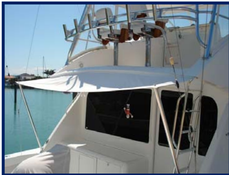
New Cockpit Sunshade