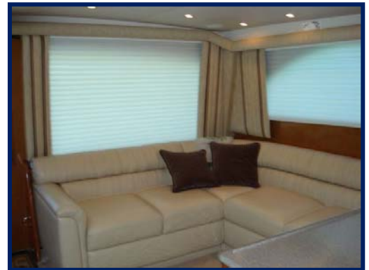
Salon Ultra Leather L Shaped Sofa