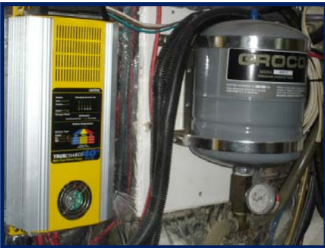
Battery Charger / Accumulator Tank