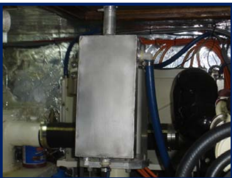
Siemens Drive Motor w/ Cooling Tank