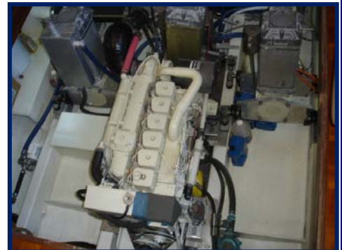
Diesel / Electrical System