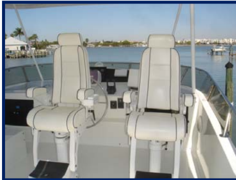
Stidd Helm Chairs