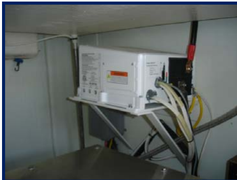
2800 Watt Inverter