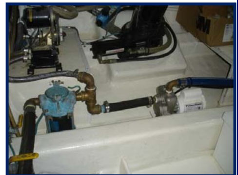
Remote Gen. Raw H2O Pump