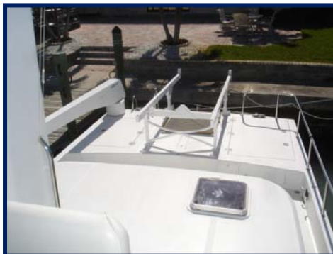
Aft Deck Extension