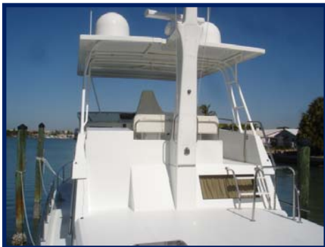
Bridge Looking Forward