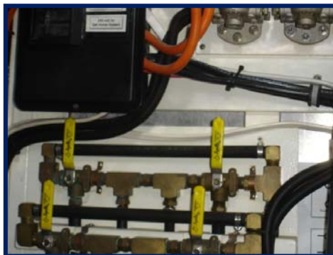
Fuel Selector Valves