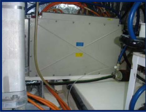
Siemens Inverter for Drive Motor