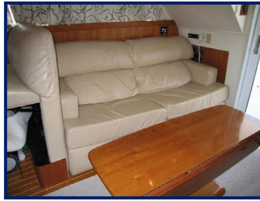
Starboard Aft Settee

Entry to the salon is via sliding glass "patio" doors with sliding screen enclosure at the aft of the salon. Windows on either side slide open for ventilation and are covered by fabric curtains. The "patio" doors have a sliding drape. There is an overhead centerline teak grab rail and the headroom in the salon is 6'4 1/2".