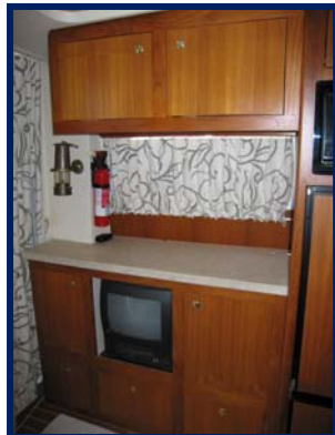
Port Aft Entertainment

To port is the "L" shaped galley followed by the entertainment center. There is spacious cabinetry built around the entertainment center as well as above and below the galley structure. Two large hatches in the sole lead down to the engine compartment via a stainless steel ladder. The teak and holly sole is covered by an area throw carpet.