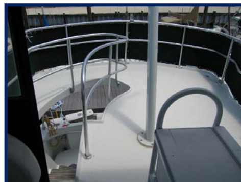
Aft Upper Deck